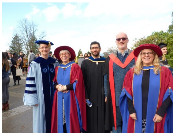
Some of the CNERS Faculty at the Nov 2017 graduation ceremonies.